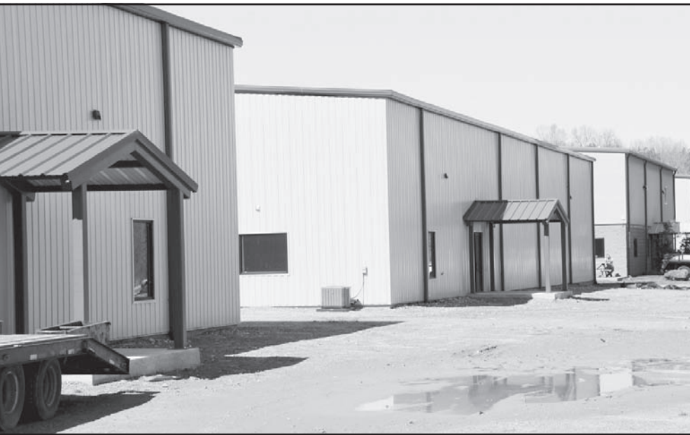
The two 12,500 square foot buildings in the foreground are new to Corrugated Replacements off Commerce Way, with the one next to Heat Treat to serve as an expanded area for the corrugated

For more information, visit missiles for the government. So, http://corrugatedreplacements. com and http://ngaheattreat.