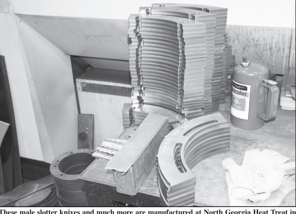
These male slotter knives and much more are manufactured at North Georgia Heat Treat in